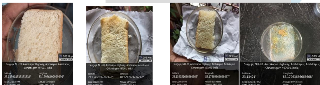
Figure4 2 Day after, Figure5, after 6days Figure6 fresh in fridge on 6 th day Figure7 9 th day