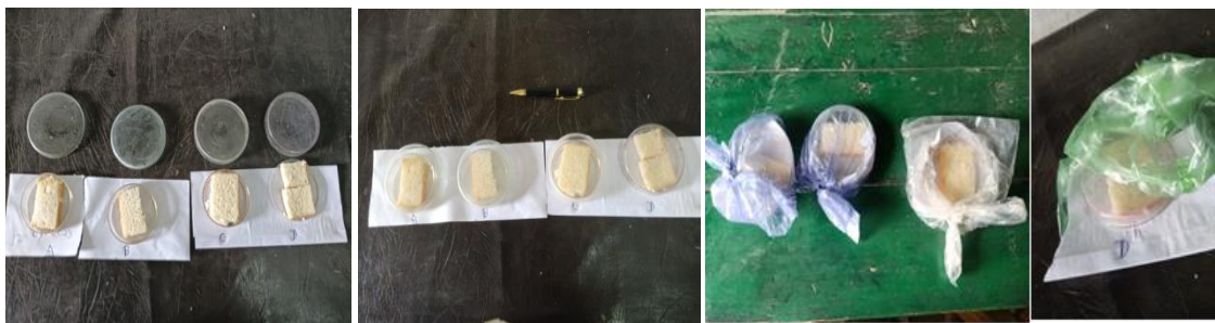
Figure1 Bread in Petri dishes Figure2 +H 2 O & covered Figure3 Safety Packing in 4 Polythene